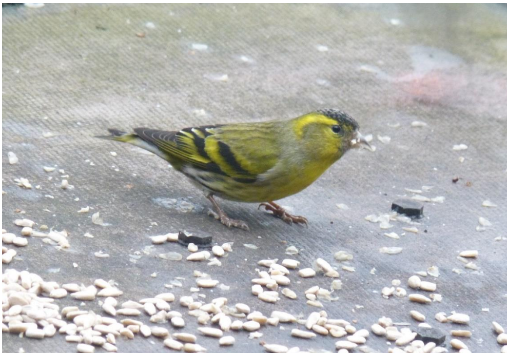
Siskin in front of the Observatory on 10th Jan, photo Sheelagh Halsey