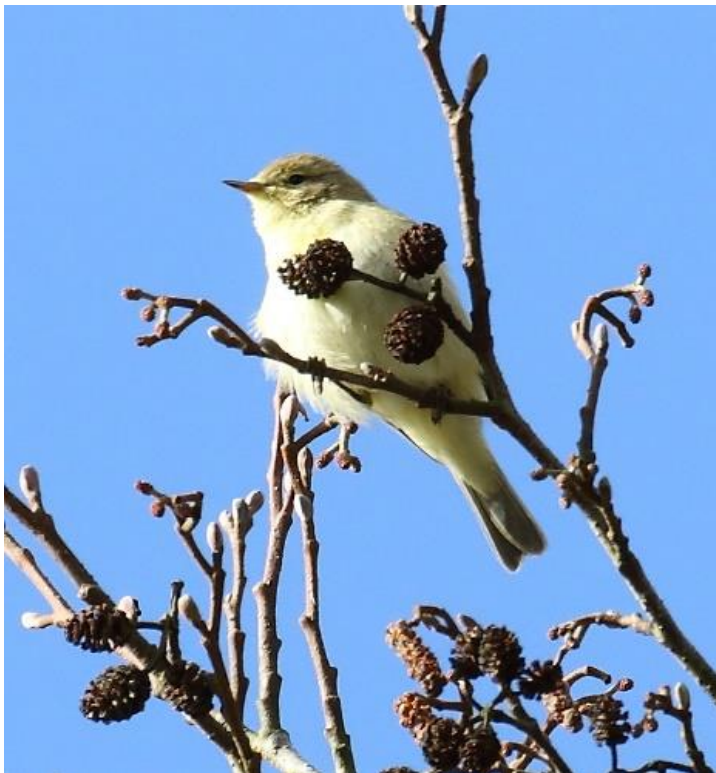
Chiffchaff on 22nd Mar