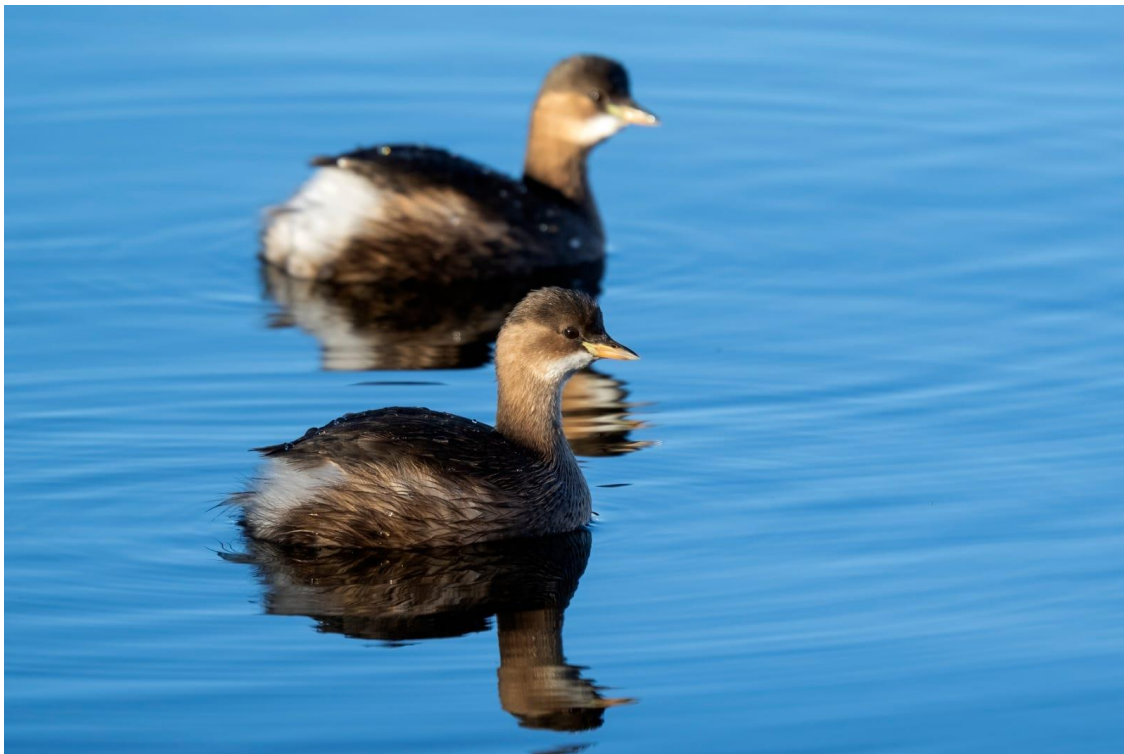
Little Grebes on 7th Jan