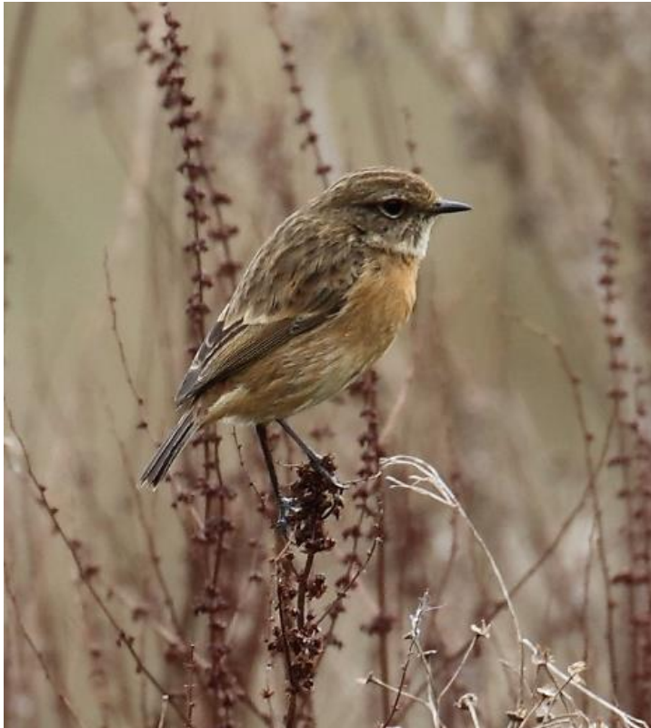
Female Stonechat on Dolls Meadow