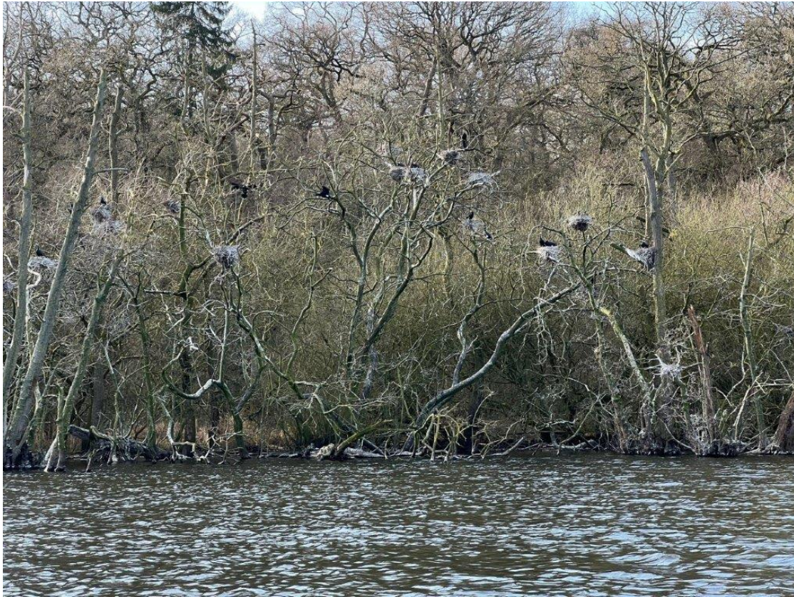
The Cormorant Colony on 21st Feb, photo Paddy Carrington