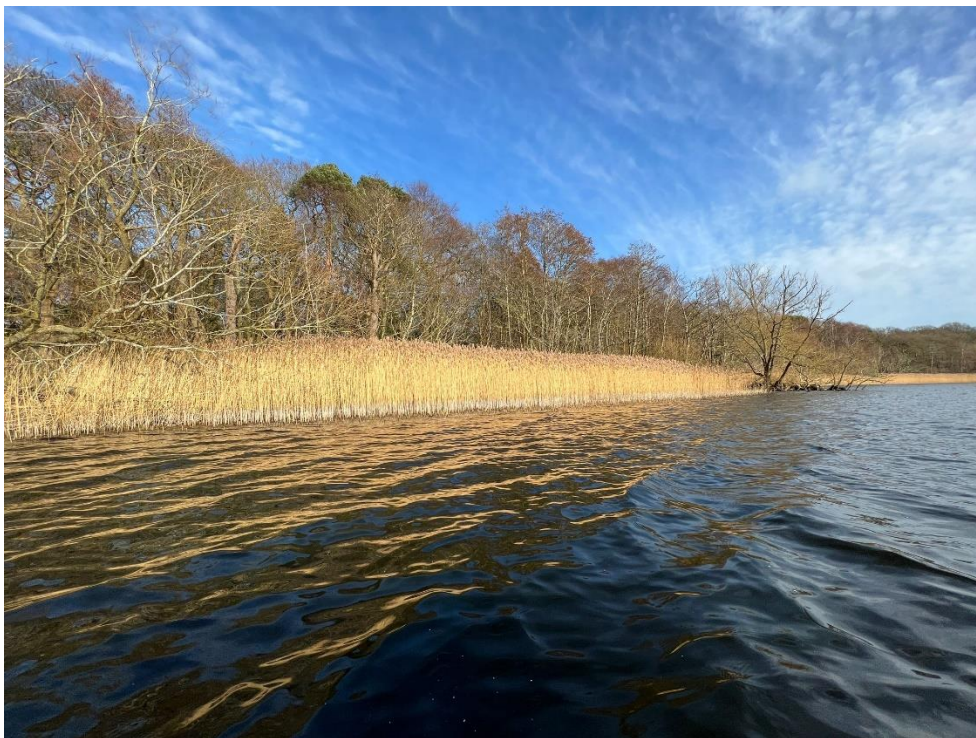
The Mere Covert reed bed on 21st Feb