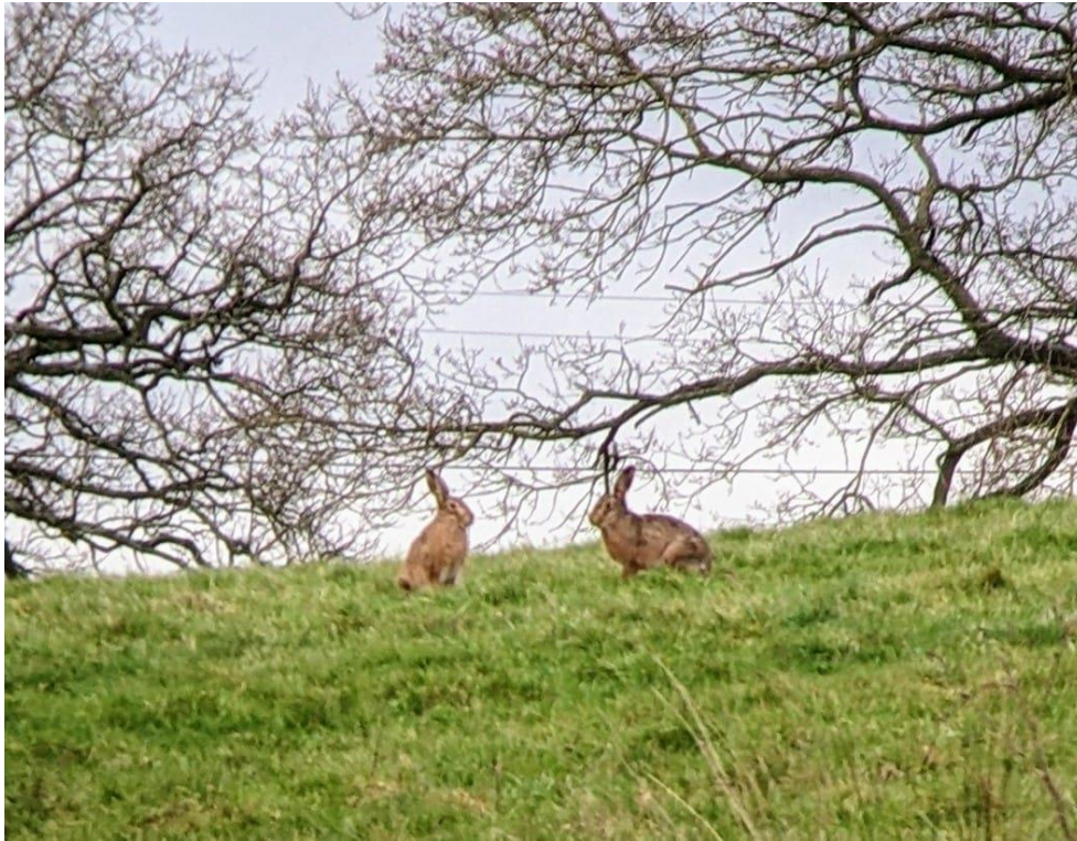
Brown Hares on 26th Jan