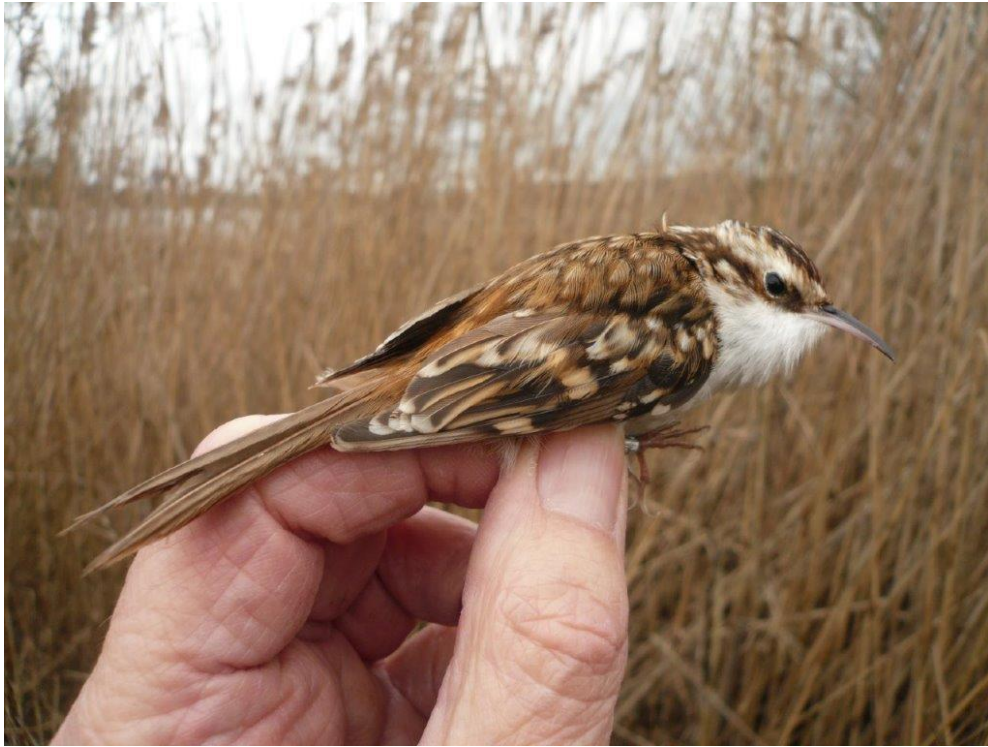
Treecreeper caught on 21st Feb